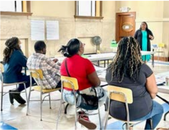
424 families benefited from WIN’s financial literacy and homebuyers classes in 2022.

“WIN’s homebuyer classes gave me the knowledge to be able to figure out if taking on such a big responsibility was worth the risk. I now feel confident with my ability to save, budget, and pick the right lender for my needs. What a great experience!” 2022 Class Participant