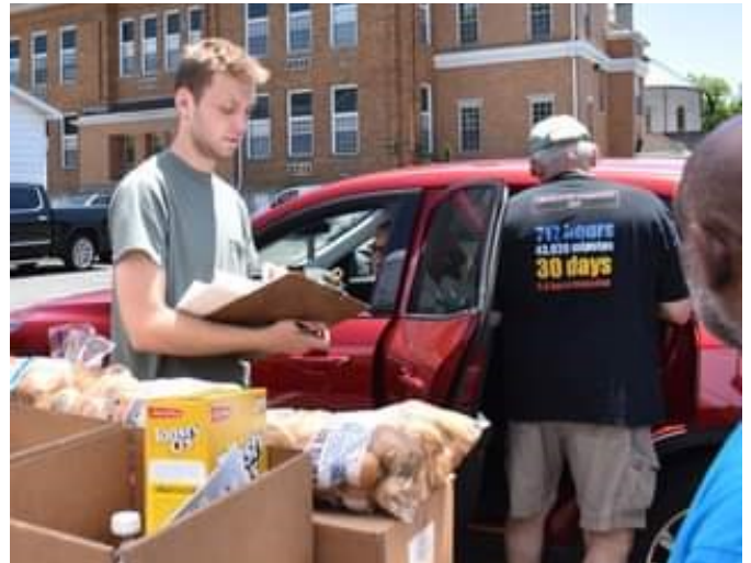
In 2022, 100 families received a total of 23 tons of fresh food at WIN’s monthly Produce Pop-Up.