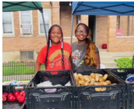
Produce Pop-Ups benefit from a stable core of volunteers.