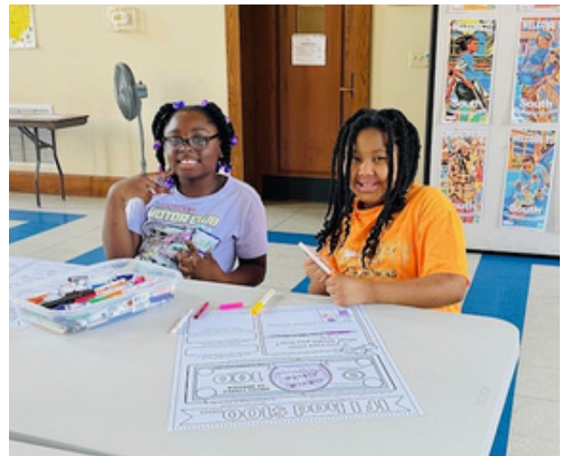
Summer campers learned the value of money through an "If I had $100..." activity.