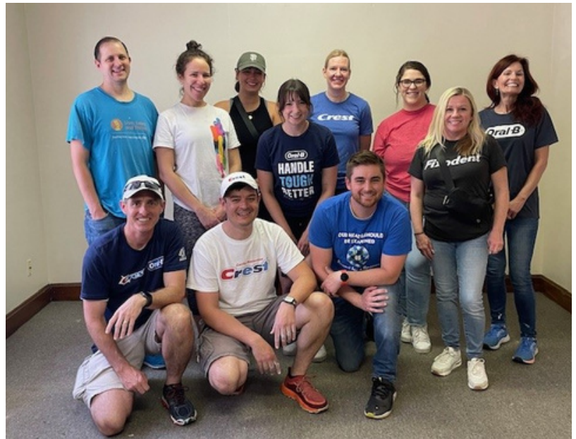
Procter & Gamble's Oral Care team spent a May afternoon painting WIN's annex.

We couldn't do it without you! In 2024, 388 WIN volunteers devoted more than 2,700 hours to create housing equity and build thriving neighborhoods. Thank you for making a difference in our urban neighborhoods!