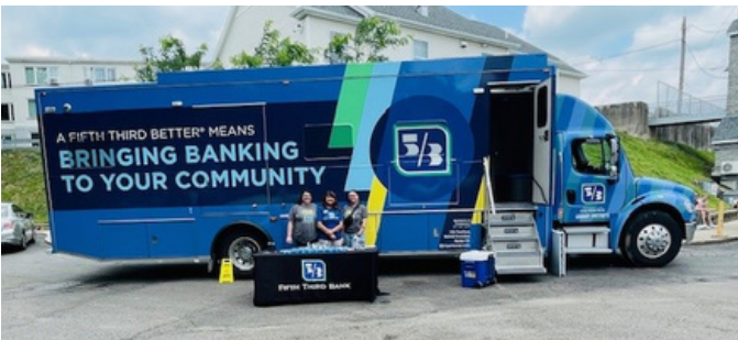
The Fifth Third eBus visited Reid's Valley View Apartments.

WIN partnered with various organizations on community outreach events focused on financial literacy and homebuyer education.