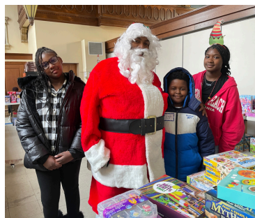
At Santa's Workshop, children chose three gifts to take home.