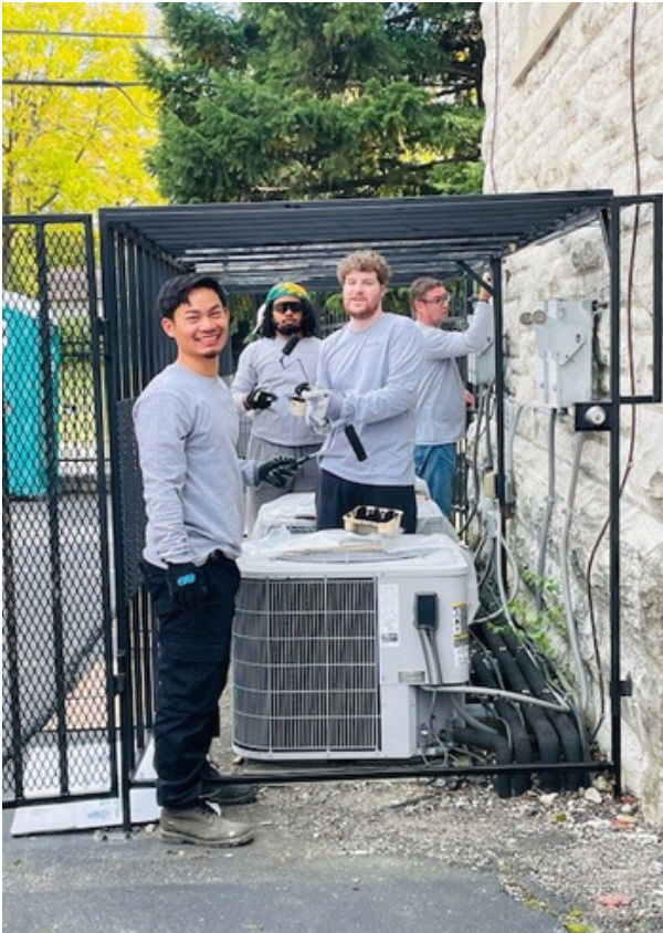
20 volunteers from Barnes Dennig spent their Outreach Day refreshing WIN's campus.

We couldn't do it without you! In 2024, 388 WIN volunteers devoted more than 2,700 hours to create housing equity and build thriving neighborhoods. Thank you for making a difference in our urban neighborhoods!