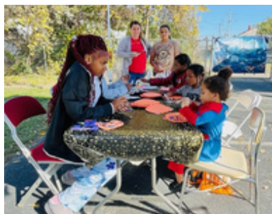
Kids made crafts, played games, and collected treats at Boo Bash.

In 2024, WIN's Youth Enrichment Program served 362 children through Bringing the World to Our Backyard Summer Camp, WIN's 5th Annual Easter Egg Hop Up, Boo Bash Trick or Treat Event, and Santa's Workshop.