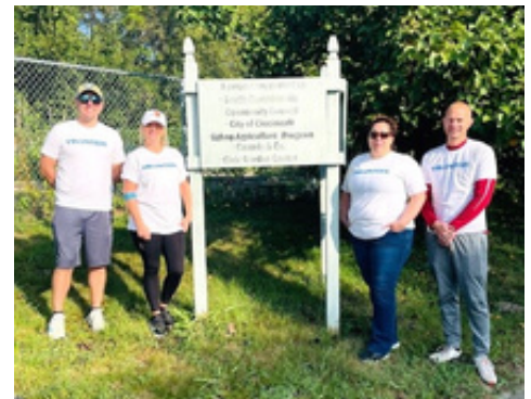
Kaufman Hall spruced up the South Cumminsville Community Garden.