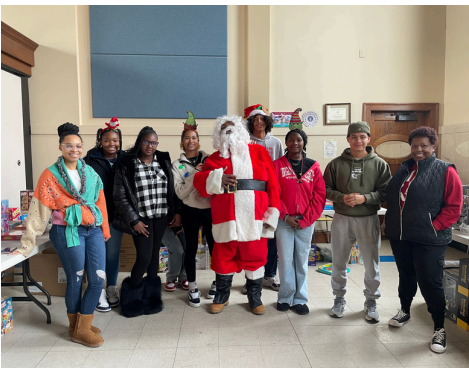
Volunteers and donors bring Santa's Workshop to life every year.

We are grateful to the 98 volunteers who provided 392 hours of labor to support WIN's monthly Produce Pop-Ups. In addition to distributing food, these events provide outreach and recruitment opportunities, including voter engagement, health care information, and information on community events and meetings.