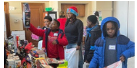
At Santa's Workshop, kids picked out three gifts to take home.