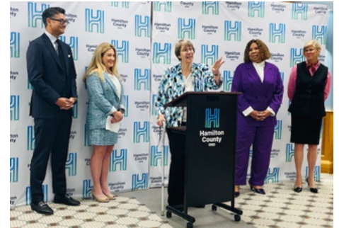
The Hamilton County Tax Forgiveness Program was announced in August.