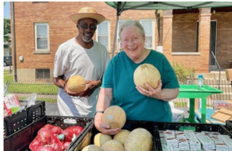
WIN's Monthly Produce Pop-Ups benefited from a strong volunteer presence.