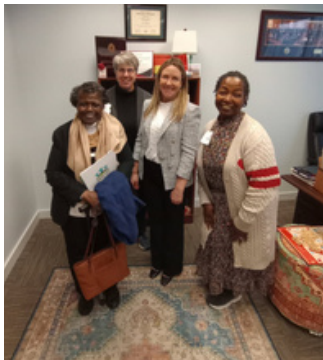
Housing Team members at OCDCA Statehouse Day.

After reaching a consensus, the team hosted meetings with Cincinnati City Council members, City of Cincinnati Department of Transportation and Engineering (DOTE), and Cincinnati Police Department, winning endorsements from three council members and the Police Department.