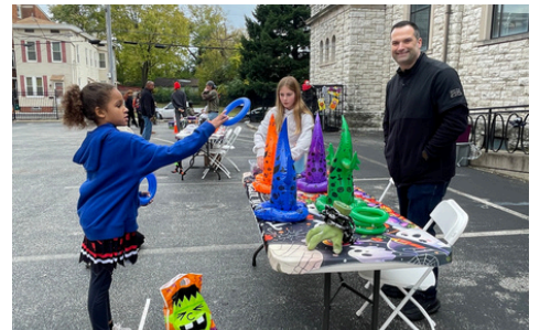
Union Savings Bank/Guardian Savings Bank sponsored Boo Bash, volunteering and donating trinkets for the kids.