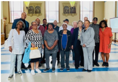
Senior IDA participants celebrated the kickoff of the 2025 program.

WIN provided workshops on Budgeting & Money Management, Identity Theft, and Life as a Homeowner to 51 people. In addition, WIN taught workshops at five outreach events.