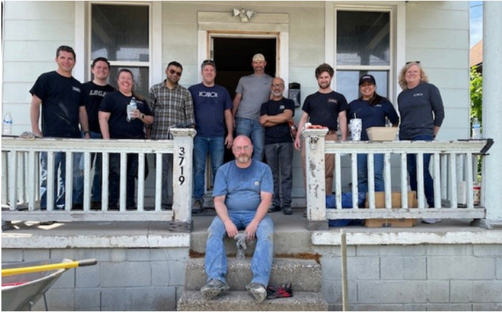
Volunteers from Crane Co. cleared debris from WIN's rehab home at 3719 Llewellyn Ave.

We couldn't do it without you! In 2025, 818 WIN volunteers devoted more than 2,200 hours to creating housing equity and building thriving neighborhoods. Thank you for making a difference in our urban neighborhoods!