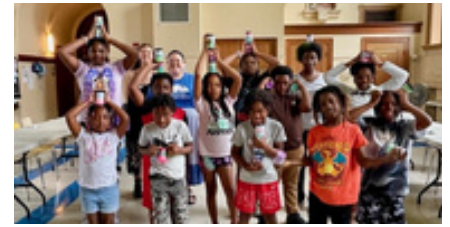
Summer campers completed many fun projects in 2025.

S. Cumminsville Community Council distributed 271 backpacks as part of their Back to School-School Supply Giveaway in collaboration with First Baptist Church of Cumminsville and Dunked-Out.