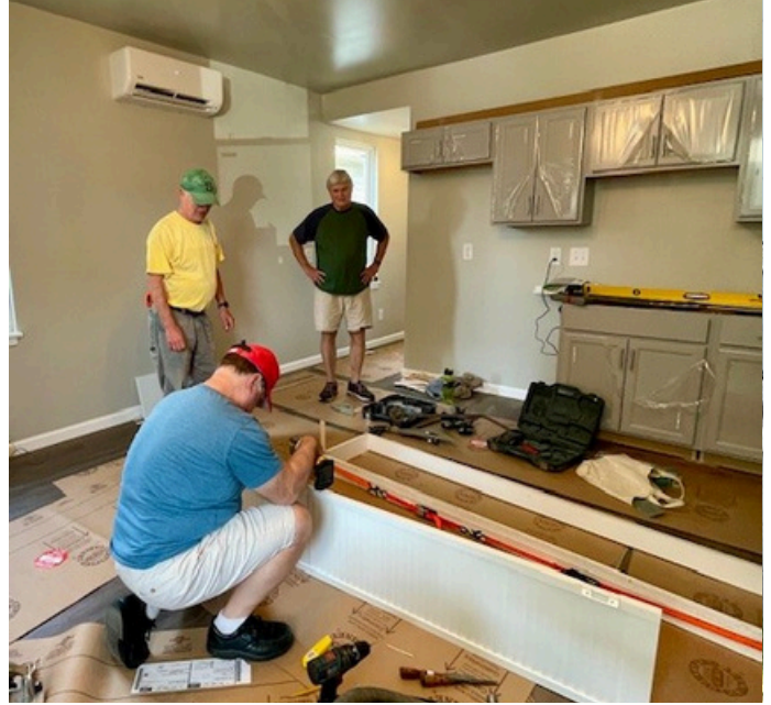
3733 Llewellyn Ave., A.K.A. "the Tiny House," is nearing completion thanks to three dedicated volunteers.