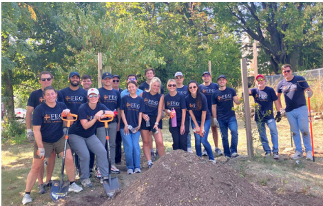
FEG Investment Advisors prepared the S. Cumminsville Community Garden for winter.