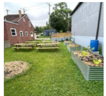
Garden @ Bethel in S. Fairmount.

Two new gardens were developed in the Beekman Corridor. We are grateful to Cincinnati Permaculture Institute (CPI), the City of Cincinnati's Office of Environment and Sustainability, the Cincinnati Health Department, and the Civic Garden Center for their partnership in expanding food access in the Corridor.