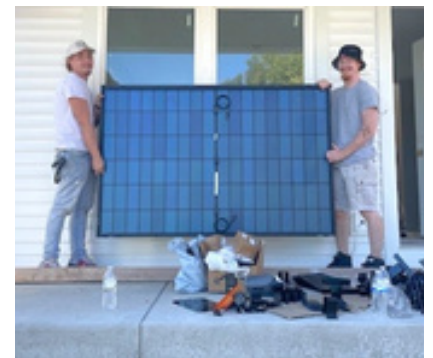
Solar panels were installed at 1789 Agnes St. in October.

WIN's Near-Net-Zero Urban Village also includes retrofitting 25 existing homes for legacy homeowners in S. Cumminsville, 15 of which have been completed. In 2025, WIN raised the funds to complete another seven retrofits in the neighborhood.